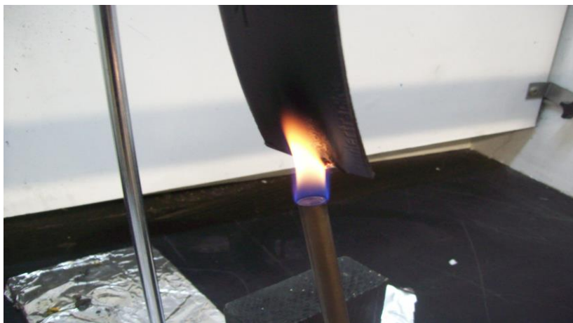
12 Second Flame Applied, Enclosure Top

Tested by: Jim Scocchera Date Tested: 3/19/14 Report Revised: 8/17/17 Plastic Manufacturer & Type: Bayer, Makrolon 2807