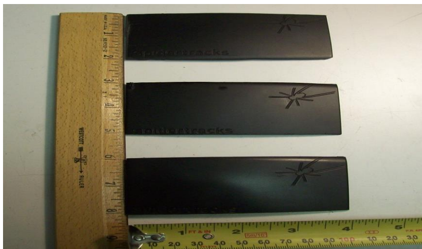
Test Specimens – Cut From S3 & S5 Enclosure Tops

Tested by: Jim Scocchera Date Tested: 3/19/14 Report Revised: 8/17/17 Plastic Manufacturer & Type: Bayer, Makrolon 2807