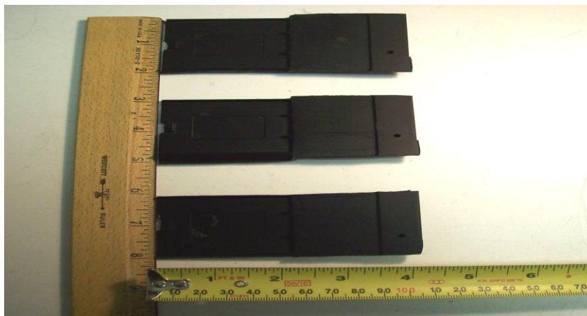
Test Specimens – Cut From S3 & S5 Enclosure Bottoms