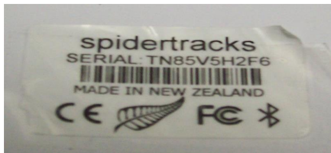
Label, Model S3 (Part # 6000.S3) Serial Number TN85V5H2F6