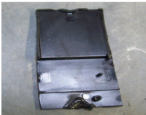
Burn Length, Enclosure Bottom