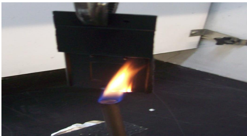
12 Second Flame Applied, Enclosure Bottom