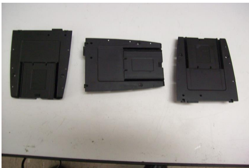
Enclosure Bottoms Removed from S3 & S5 Units