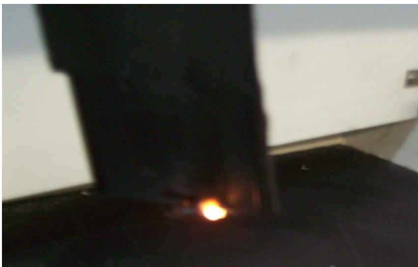
Flame Time, Enclosure Bottom