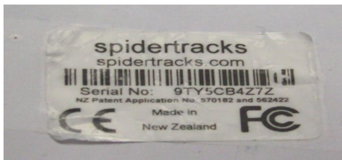
Label, Model S3 (Part # 6000.S3) Serial Number 9TY5CB4Z7Z

Tested by: Jim Scocchera Date Tested: 3/19/14 Report Revised: 8/17/17 Plastic Manufacturer & Type: Bayer, Makrolon 2807