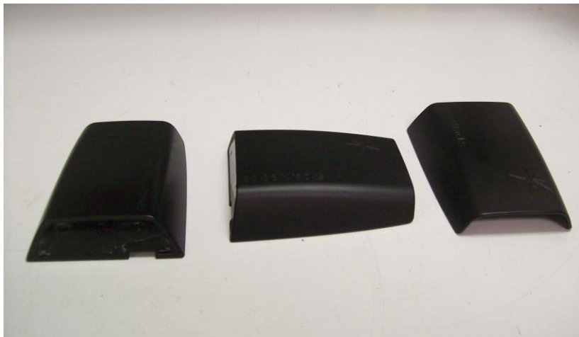
Enclosure Tops Removed from S3 & S5 Units

Tested by: Jim Scocchera Date Tested: 3/19/14 Report Revised: 8/17/17 Plastic Manufacturer & Type: Bayer, Makrolon 2807