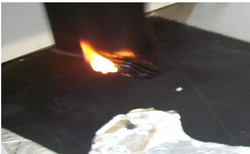
Flame Time, Enclosure Top

Tested by: Jim Scocchera Date Tested: 3/19/14 Report Revised: 8/17/17 Plastic Manufacturer & Type: Bayer, Makrolon 2807